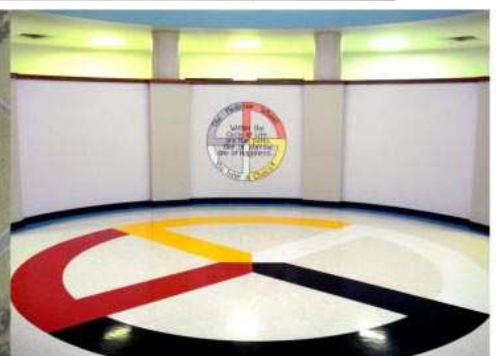
ROSEBUD JUVENILE DETENTION CENTER ROSEBUD SD WANBLI WICONI TIFI YOUTH WELLNESS CENTER VIRTUAL VIDEO TOUR - JULY 2011

BJA Bureau of Justice Assistance © 2011 All Rights Reserved WEBSTERPRODUCTIONS, INC.