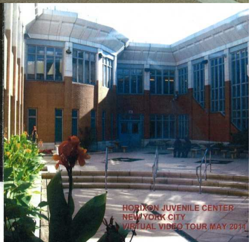
HORIZON JUVENILE CENTER NEW YORK CITY VIRTUAL VIDEO TOUR MAY 2011